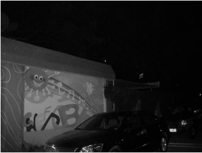
Night time with the IR Illuminator