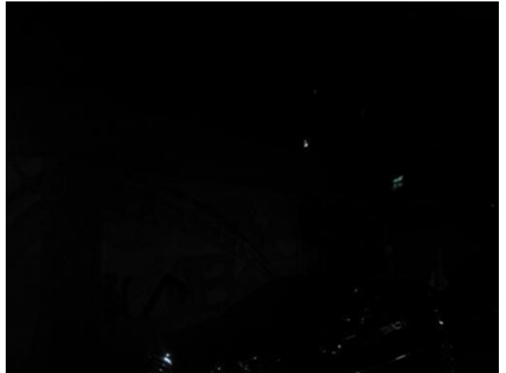
Night time without the IR Illuminator